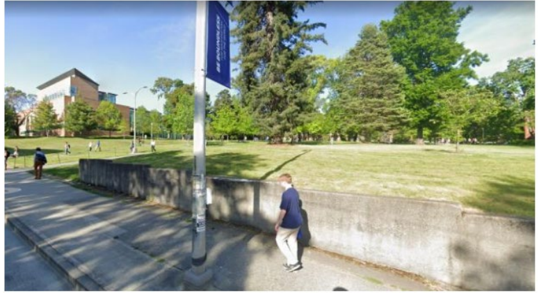
Serves those exiting on north end of the building

Lawn near Parrington across 15th Ave NE from Social Work Building north end.